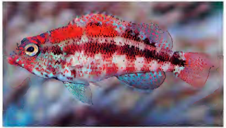
FIGURE 11. Serranus sp. from Ghana.